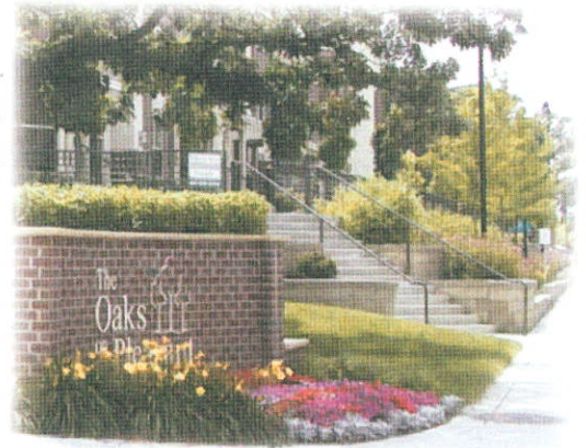
Oaks on Pleasant Residential

Provide more housing opportunities, upgrade commercial properties and offer greater enjoyment of the natural and recreational amenities of Wood Lake and Richfield Lake. Achievement will help ensure Richfield remains the best place to live, work, learn and do business in the Twin Cities metro area.