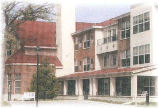
The Pines Assisted Living