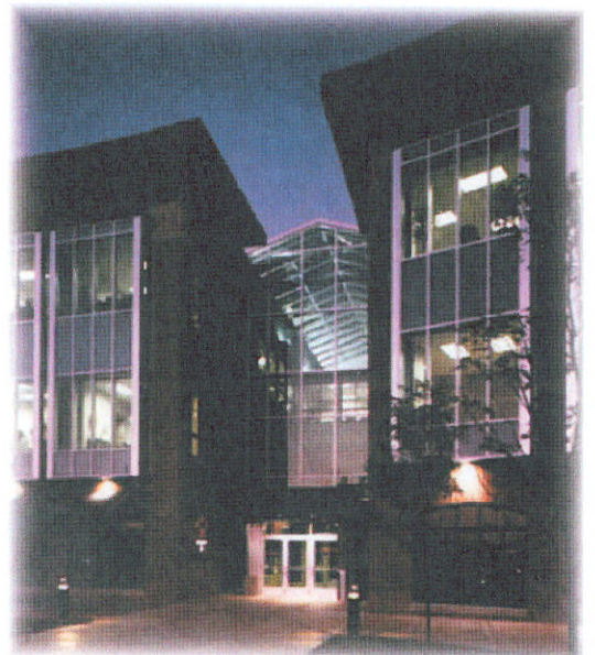
Woodlake Centre Retail and Office