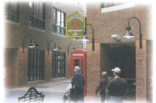
Woodlake Centre Interior Court