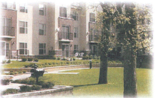
Oaks on Pleasant Open Space