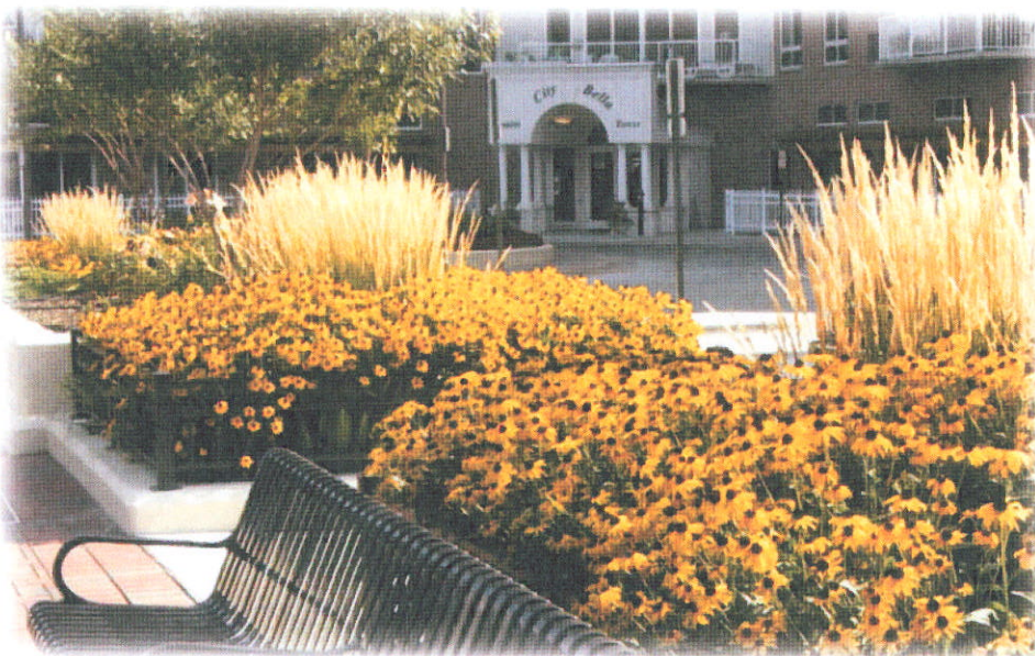
City Bella Gardens