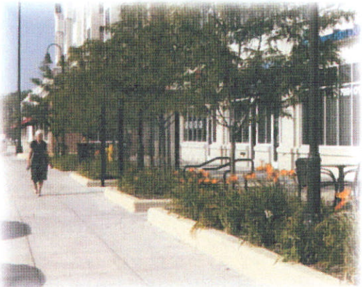
City Bella Retail