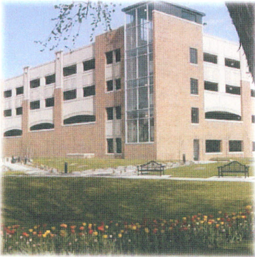
Woodlake Centre Parking Ramp