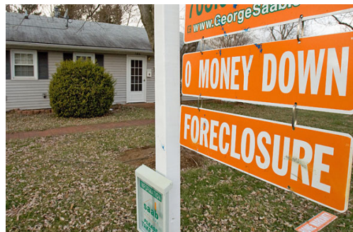
Many homes in foreclosure are vacant which leads to unkempt properties.

However, this process takes time and City staff has been strained to keep up with the unfortunate demand created by the foreclosure crisis. These vacant homes have the greatest negative impact on the neighbors living near them.