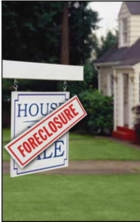
There are approximately 300 homes in some stage of the foreclosure process in Richfield.

Foreclosures have risen dramatically throughout the nation during the past two years. Richfield is not immune to this unfortunate trend. Currently, there are approximately 300 properties in the foreclosure process.