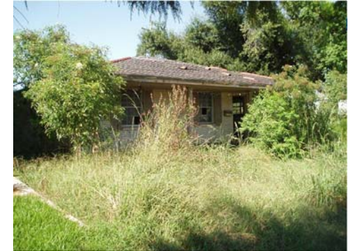
Help maintain the look of your neighborhood by adopting a house today!