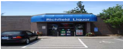
6444 Penn Ave. (612) 861-9380